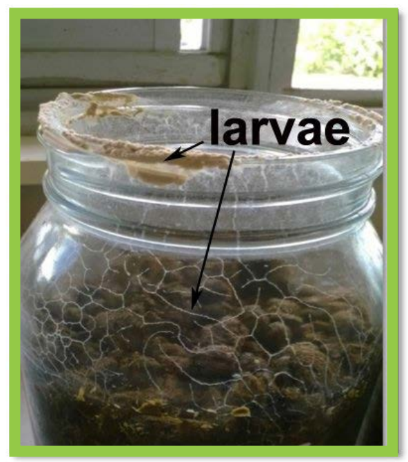
Figure 1. H. contortus infective L3 larvae emerging up the side of the glass jar.

By the time larvae reach the L3 infective stage, they have developed a protective external sheath, an attribute that gives them the resilience and ability to survive over a range of climatic conditions. At this stage the larvae do not feed, but survive on reserves that have been stored in development. In warm, humid conditions the larvae are more active and will have a greater demand for their limited food reserves. Whereas, in cooler temperatures, the larvae are less active, consume fewer reserves and will survive longer on pasture. When the larvae are finally ingested by a grazing animal, this protective sheath is shed or ex-sheathed (Figure 2) and larvae resume feeding in the host to develop to the adult worm. Unfortunately, larvae on pasture cannot be viewed with the naked eye, hence the degree of contamination and the distribution on pastures is not evident, nor is the particular worm species, which can vary in pathogenicity (disease-causing ability) to grazing animals.